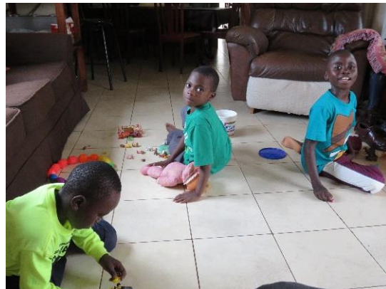
Top is the dining hall at the orphanage. Below is the nursery section at our Bible study.

Presidential elections are scheduled for Feb. 18 so please pray for peaceful elections. There is a potential for violence.