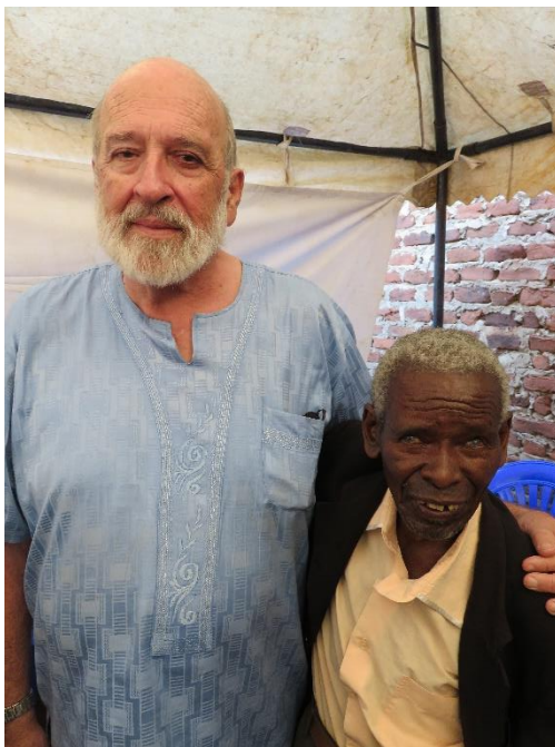
Here I am with a Faithful Pastor who planted 40 churches