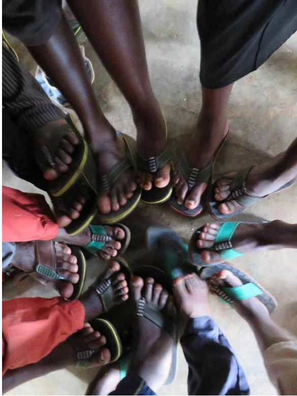
At the orphanage, children show off the nice sandals provided by one of our supporters

Our children are required to attend weekly church and Bible study. Currently we are doing a close study of the book of Matthew. We are seeing fruit from the years we have been teaching youth. Three of our students are currently in Bible College. Others are showing they will be future church leaders and helpers.