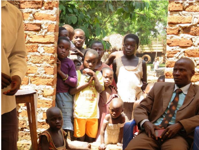
The Whole Village Attended

This past weekend we visited a remote village to participate in the graduation of 18 ATA students. This is our first visit to an African village since Bob was sick, and it was a delight to be part of the graduation. This village is very remote; one of the unique things about ATA is that our teaching works in even the most remote places. It was a very enthusiastic celebration.